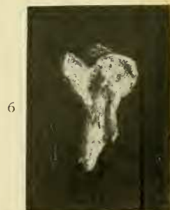
FIGS. 1 AND 2.—Right humerus, type of Gallinago anthonyi . FIGS. 3 AND 4.—Right ulna, type of Corvus pumilis . FIGS. 5 AND 6.—Broken right metacarpus, type of Polyborus latebrosus .